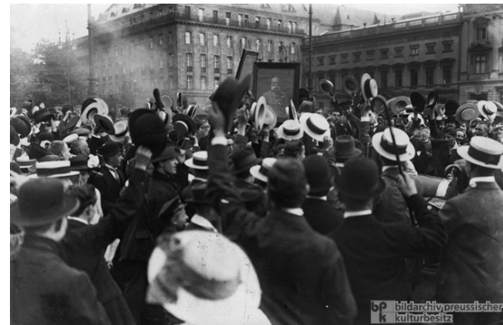
Figure 1: A crowd of Germans gather in Berlin holding the portrait of Austrian Emperor Franz Joseph I to support their ally in the face of a burgeoning conflict with Serbia. Photograph taken by an unknown photographer, dated August 1, 1914 in German History in Documents and Images (GHDI).