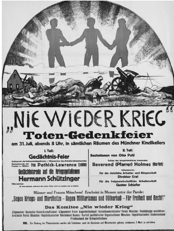
Figure 3: A poster advertises “No More War” and a July 31, 1922 commemoration ceremony to honor those killed in combat. The commemoration was to take place in Munich. Poster in Benjamin Ziemann’s Contested Commemorations .