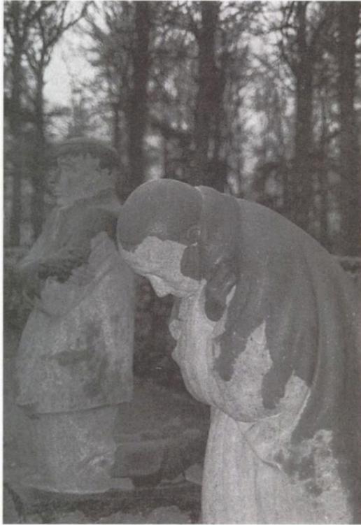
Figure 7: Die Eltern by Käthe Kollwitz, Roggevelde German war cemetery, Vladslo, Belgium, image in Jay Winter's Sites of Memory, Sites of Mourning .