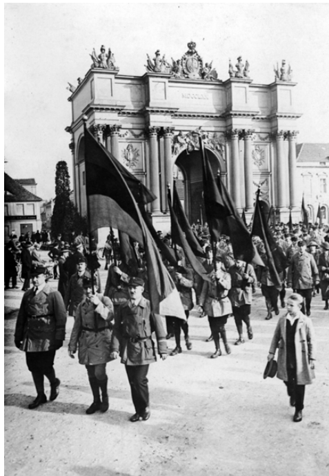
Figure 4: Reichsbanner members march at a rally in Potsdam in militaristic formation holding German flags. Photograph taken in October 1924, in German History in Documents and Images.